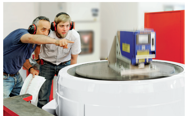
LDS shaker system from Hottinger Brüel & Kjær (HBK)

Vibration Profile Design uses the fatigue damage spectrum (FDS), a mathematical approach described in standards NATO STANAG 4370 (AECTP-240)/UK DEF STAN 00-35/MIL-STD-810G. With the FDS, engineers can apply widely used fatigue concepts like the SN curve and Miner’s Rule for damage accumulation. The FDS is computed from either measured vibration data or existing shaker specifications to quantitatively assess the potential for fatigue failure in parts that are exposed to vibration loading. It provides a relative fatigue damage estimate based on acceleration levels and exposure time.