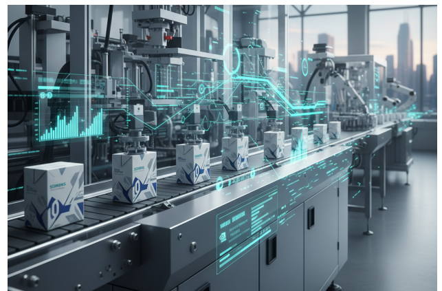
Data-driven precision in action: A state-of-the-art packaging machine, showcasing advanced reliability monitoring in a modern food and beverage facility.

This approach reduced overall test duration while increasing confidence in performance outcomes. Reliability Growth Programme testing supported by ReliaSoft Weibull++ is now embedded as a standardised engineering procedure. The ability to stop testing early when reliability targets are met further improves efficiency, allowing teams to focus resources where they deliver the greatest impact.